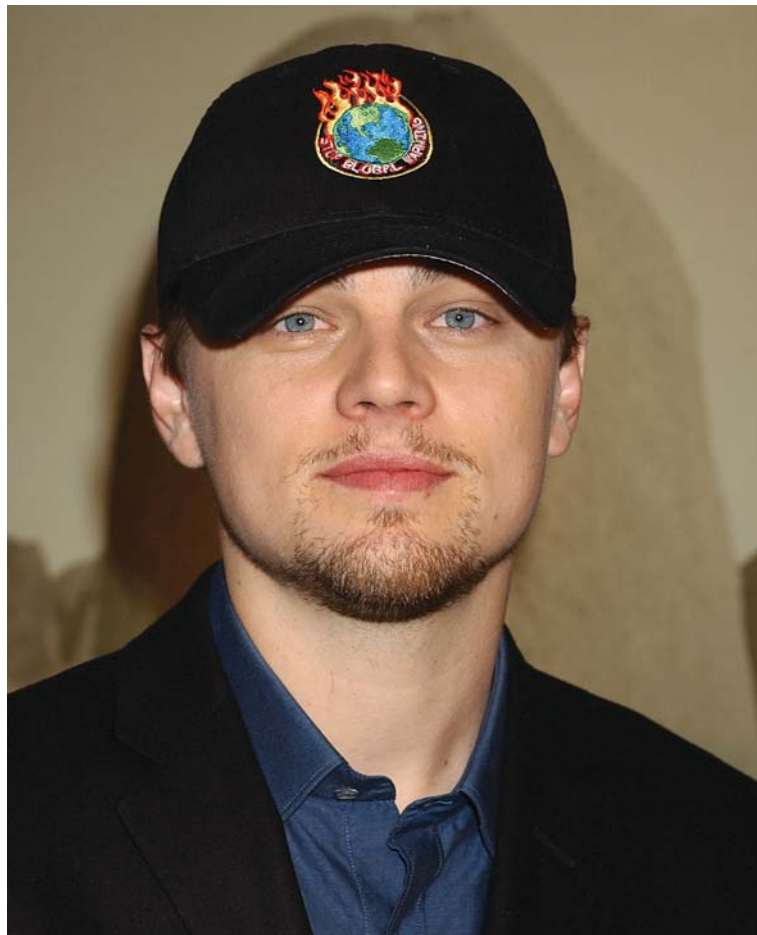
Larry David and Leonardo DiCaprio are NRDC supporters.